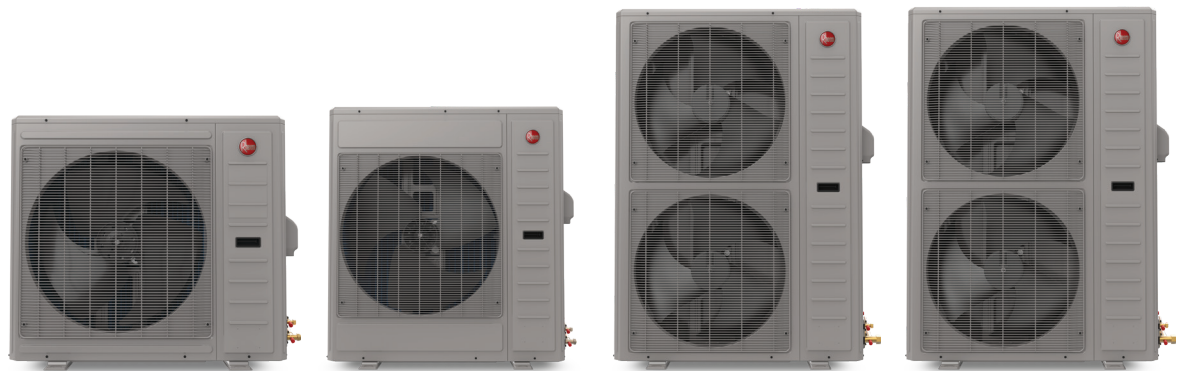
2 ton RD18AY24AJVCA