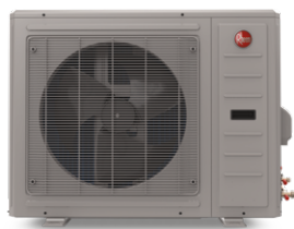
2 ton RD16AY24AJVCA