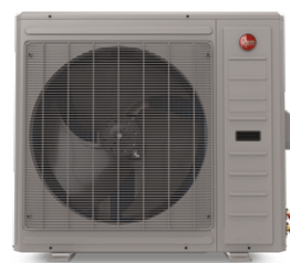
4 ton RD16AY48AJVCA