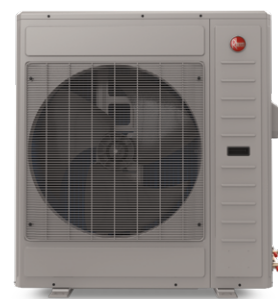
5 ton RD16AY60AJVCA