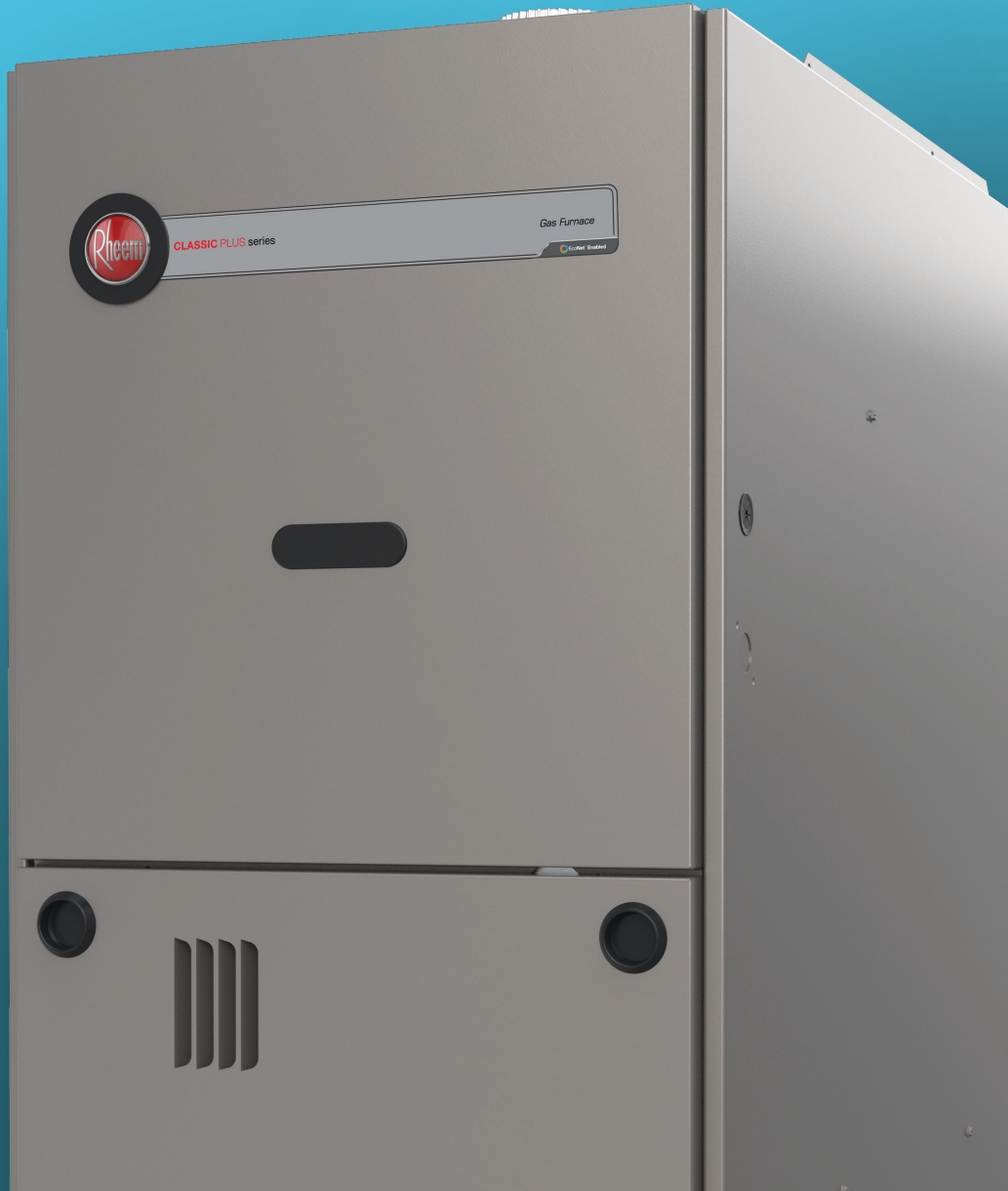
Downflow model shown