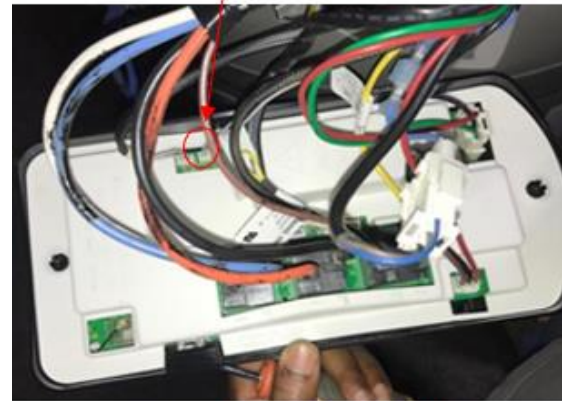
Control Board Assembly Wiring